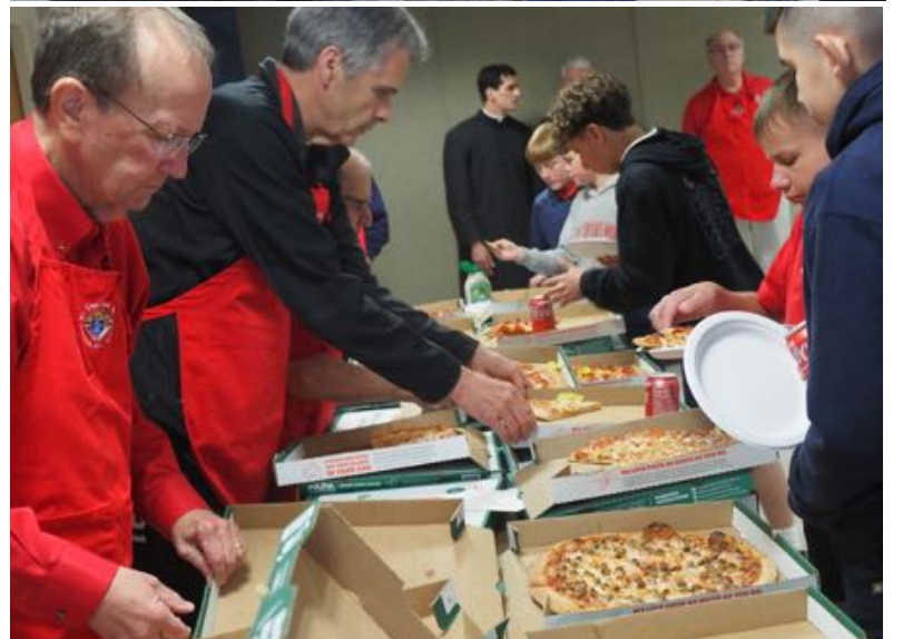
Momma Mia It's a Pizza Party! Recently the Knights of Columbus Council #14270 St. Thomas More hosted a pizza party for the Altar Servers of their Parish.