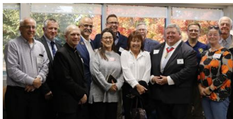
Above: Members and spouses of the local Knights Councils who supported the purchase of the new ultrasound machine.